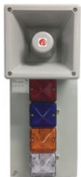
FA300 Alarm Bar