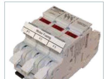
Continuous marking strip and adaptors