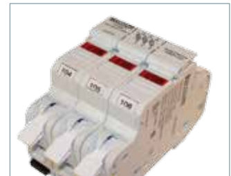
WMB Marker System