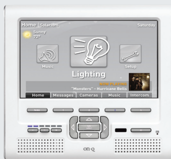
7" LCD Console connected to the Integration Module (HA5000, HA6001)

A graphical user interface allows homeowners to see into and control their Unity Home System. It is logically laid out for homeowners to be able to call room-to-room with their intercom, adjust the volume of the music playing in the living room and view the front door camera with the navigational arrows and soft buttons on the LCD Console. With the release of software version 2.3 and additional hardware pieces, the Unity Home System now includes support for lighting control and Internet Radio, as well as mobile device control, remote IP camera viewing, and interface expansion capabilities.