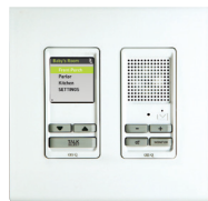
IC5000-XX Selective Call Intercom Room Unit