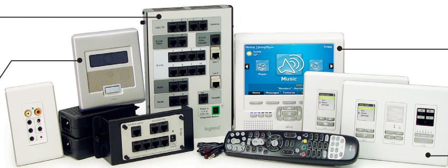
HA6401-BS 3-Room Unity Home System Kit

All products offered in the Studio Design.