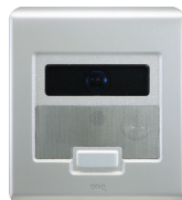
IC5003-XX Selective Call Intercom Video Door Unit