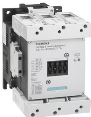
Contactor LE,300a,0NC,3NO,24V Contactor LE,300a,0NC,3NO,24V