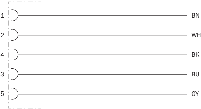
Contact assignment of the M12 female connector