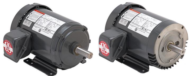
Steel Edge™ Motors Footed