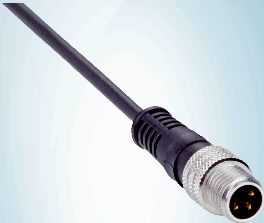
Connecting cable (plug-open)